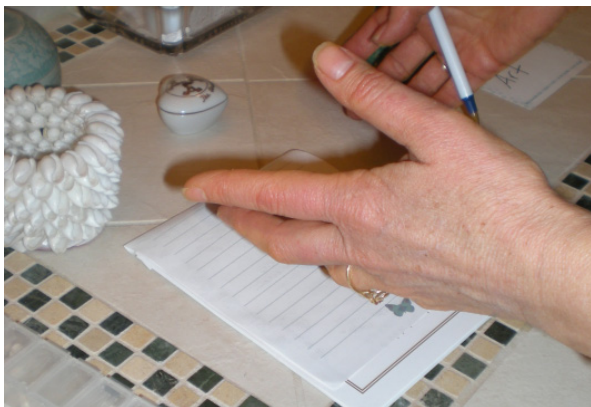
Figure 3: P4 left a notepad in the bathroom because questions for the doctor often came to her there.

Formulating questions and issues to raise in appointments was also often done in collaboration with others. P13 thought of questions while commuting with her sister and talking to a colleague at work who was a nurse. P8 and her husband emailed questions to one another whenever one of them would think of one. Further, P11 explicitly sought advice from other people on important questions to ask: “I talk to other people to find out what questions they would ask. My sister asked a nurse practitioner if she knew what she would ask related to...what does it mean that this tumor is disappearing and so this woman had some questions related to that that I wouldn't have thought of asking.”