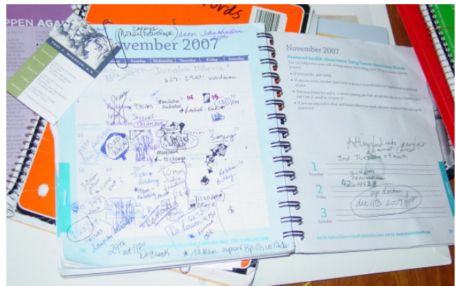
Figure 2: P3's mobile reference collection included her calendar, business cards, and notes.

Mobile reference collection. In addition to appointment bundles, nearly all participants also carried a more general mobile collection of important information. For example, several participants carried a list of the medications they took, since they were "asked that all the time" {P8}. As P12 told us, "always keep a list of all your meds... You might remember the name of the drug but you might not remember individual dosages." Mobile reference collections took different forms, from pocket calendars stuffed with business cards and loose paper to Blackberries (Figure 2). These collections allowed participants to schedule appointments and coordinate care whenever and wherever the need arose. As we explain in the Discussion, mobile reference collections are very similar to the just-in-time strategy identified by [14] in home-based PHIM.