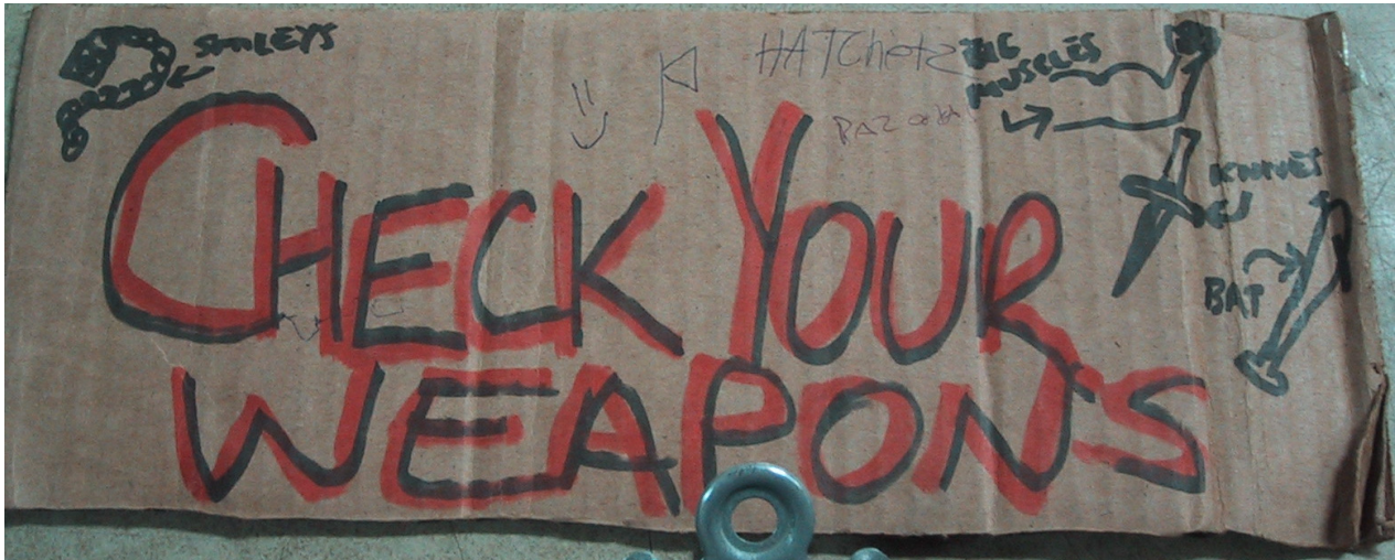
Figure 3. Graffiti on this sign lists weapons (e.g., big muscles, knives, bat). By continuing to display this sign, staff show respect for the autonomy of the homeless young people.