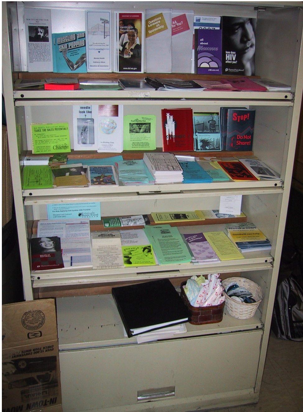
Figure 2. Permanent, self-service displays are less common.